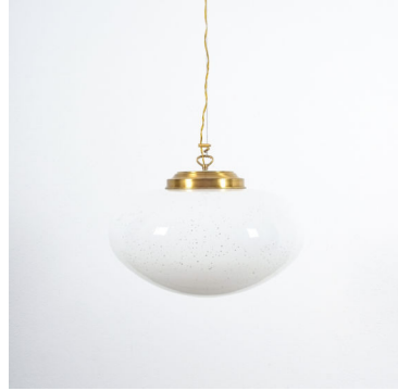
Murano Large Glass Ball Pendant Lamp with Gold Inclusions, Midcentury, Italy