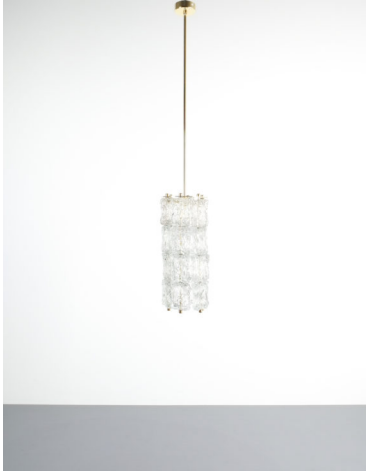
Barovier Toso Midcentury Murano Glass Pendant Lamp, Italy