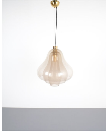
Carlo Nason Large Three Shade Pulegoso Glass Pendant Lamp, Italy, 1960