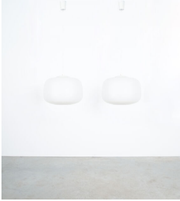
Limburg Opaline Glass Midcentury Pair of Pendant Lamps, Germany