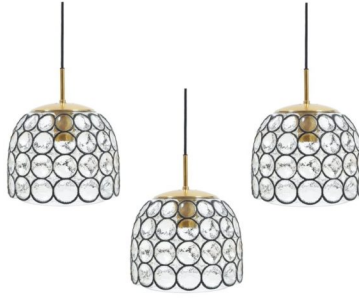
Limburg Set of Three Large Midcentury Iron and Glass Pendant Lamps