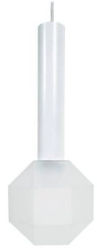
Multiple Honeycomb Pendant Fixtures By Limburg