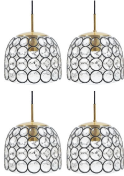
Limburg One of Four Large Midcentury Iron and Glass Pendant Lamps by Limburg