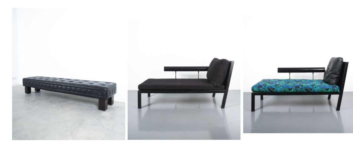
Matteo Thun One of Two Tufted Leather Banquettes Bench Materassi, Wittmann