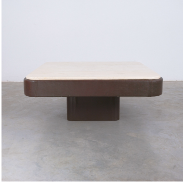
De Sede DS 47 Large Square Table Brown Leather Travertine Stone, Circa 1970