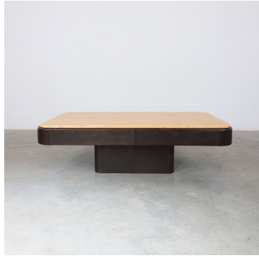
De Sede Table DS 47 Table Leather Travertine Stone, Circa 1970