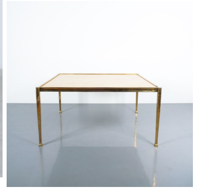
Parchment Square Solid Brass Coffee Table, France, 1965