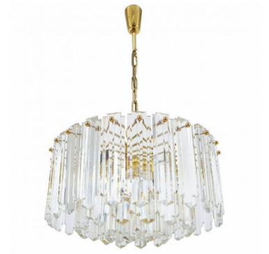
Kalmar Tiered Crystal Glass and Gilt Brass Chandelier