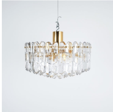
J.T. Kalmar Palazzo Chandelier Gold Brass Glass Lamp, Austria 1960