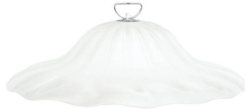
J.T Kalmar Kiriglas Glass Pendant Lamp