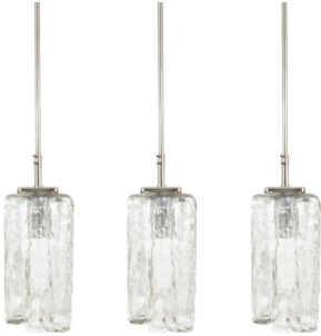
J.T. Kalmar Clear Glass 25 Pendants, Austria