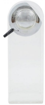
Lucite Chrome Table Light by Gino Sarfatti