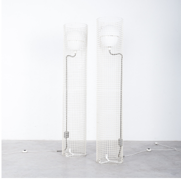
Gino Sarfatti For Arteluce Floor Lights Model 1102, Italy, 1971