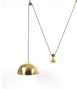
Florian Schulz Adjustable Refurbished Brass Counterweight Pendant Lamp