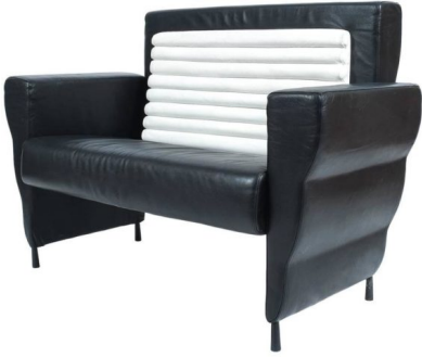
Ugo La Pietra Leather Sofa Flessuosa, 1985