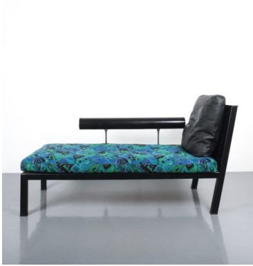
Antonio Citterio for B&B Italy Leather Chaise Lounge Baisity