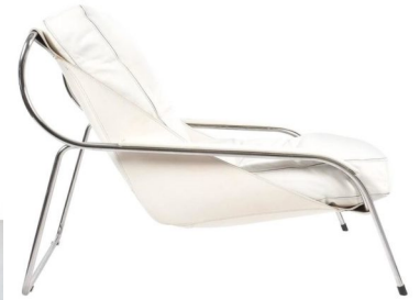
Marco Zanuso Maggiolina White Leather Chair by Zanotta, 1947