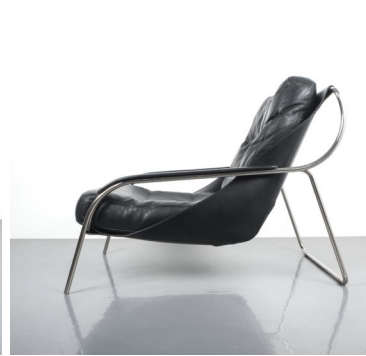
Marco Zanuso Maggiolina Sling Black Leather Chair by Zanotta, 1947