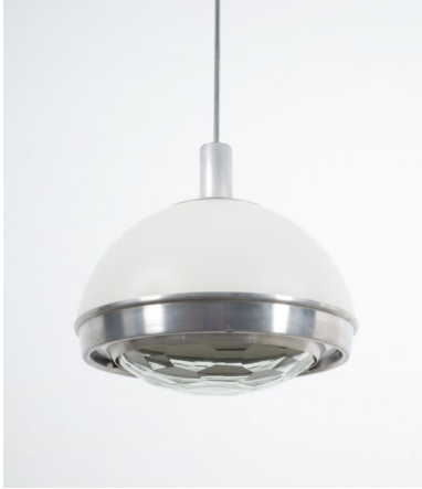
Stilnovo Translucent Optical Honeycomb Glass Pendant Lamp Glass, circa 1965