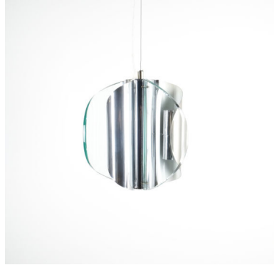
Fontana Arte Pendant Lamp or Chandelier From Curved Glass And Chrome, Italy 1965