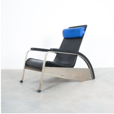
Jean Prouvé Reclining Grand Repos Lounge Chair