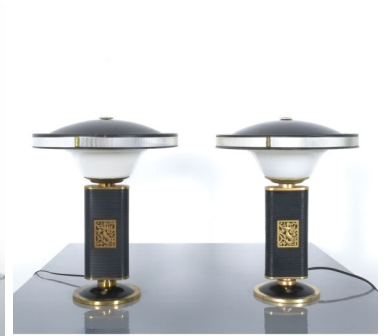
Eileen Gray Pair of Table Lamps 'Sirène' for Jumo, Midcentury