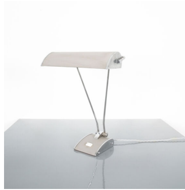
Eileen Gray Iconic Table Lamp for Jumo, Midcentury