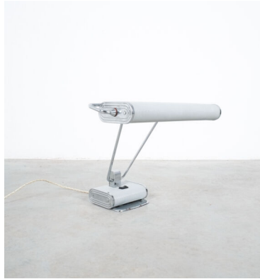
Eileen Gray Table Lamp for Jumo, Art Deco France 1935