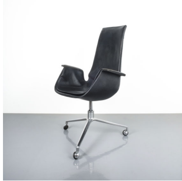
Fabricius and Kastholm Black Blue High Back Bird Desk Chair FK 6725, 1964