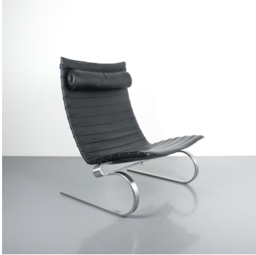
Poul Kjaerholm Early Fritz Hansen PK20 Lounge Chair in Black Leather, 1987