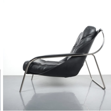
Marco Zanuso Maggiolina Sling Black Leather Chair by Zanotta, 1947