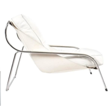
Marco Zanuso Maggiolina White Leather Chair by Zanotta, 1947