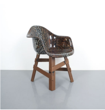
Eames Appropriation Dining Armchair with Polished Resin Leopard Seat