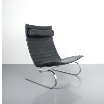
Poul Kjaerholm Early Fritz Hansen PK20 Lounge Chair in Black Leather, 1987