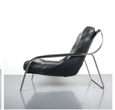
Marco Zanuso Maggiolina Sling Black Leather Chair by Zanotta, 1947