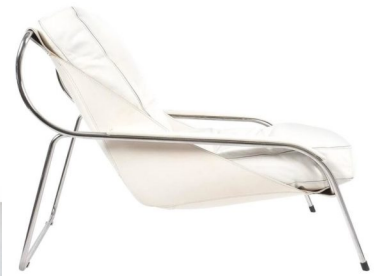
Marco Zanuso Maggiolina White Leather Chair by Zanotta, 1947