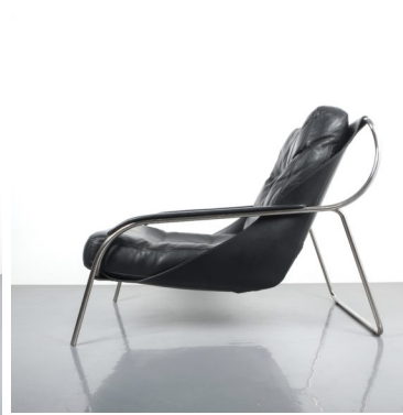
Marco Zanuso Maggiolina Sling Black Leather Chair by Zanotta, 1947