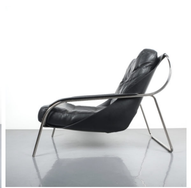
Marco Zanuso Maggiolina Sling Black Leather Chair by Zanotta, 1947