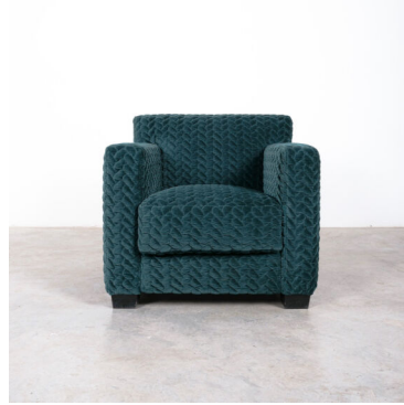
Jean Michel Frank Lounge Armchair And Ottoman Velvet, 1932