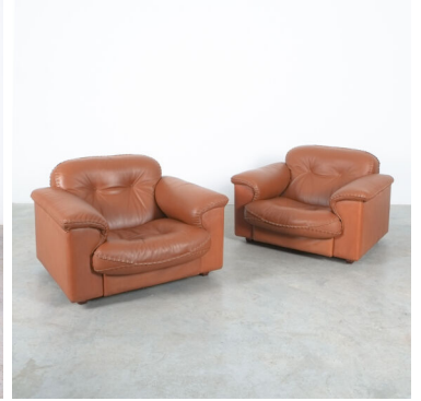
De Sede Reclining Leather Lounge Armchair Pair DS 101, 1969