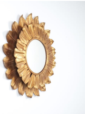
Sunburst Backlit Mirror Round Gold Leaf, France 1960