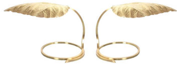
Tommaso Barbi Refurbished Pair of Brass Rhubarb Table Lamps, Italy, 1970