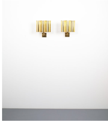
Art Deco Style Artisan Solid Brass Wall Lamps Sconces, France 1950