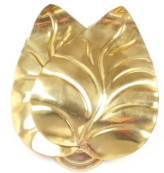
Tommaso Barbi Style Brass Double Leaf Wall Lamp, 1950