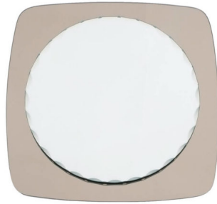
Fontana Arte Style Scalloped Mirror