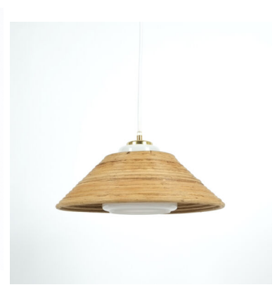
Doria Rattan Opal Glass Pendant Lamp NOS, 1960