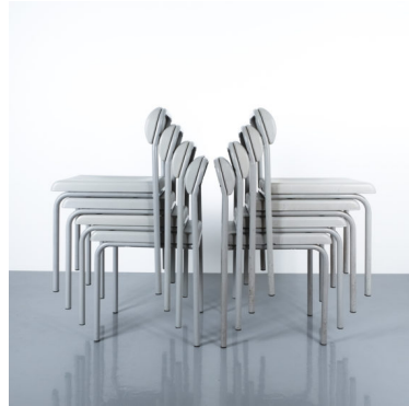
Ettore Sottsass One of Seven Greek Chairs Grey Bieffeplast, Italy, 1980