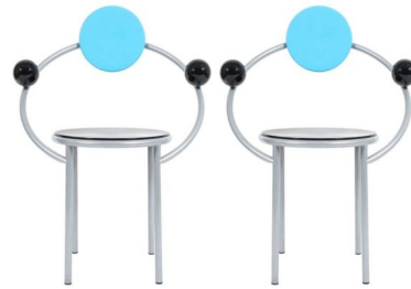
Memphis First Chair by Michele de Lucchi