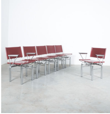
Hans Ullrich Bitsch Set of 6 Red Leather Chairs Series 8600