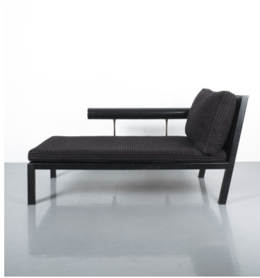
Antonio Citterio Chaise Lounge Sofa Baisity for B&B Italy