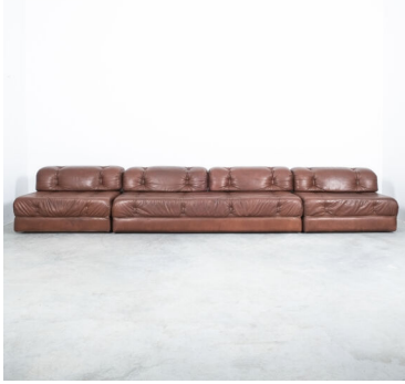
Wittmann Atrium Sofa and Two Chairs Brown Leather, Austria