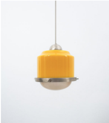
Stilnovo Yellow Glass Pendant Lamp Glass, circa 1950